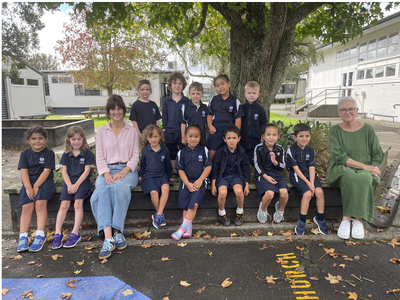
New Cohort start in room 1!