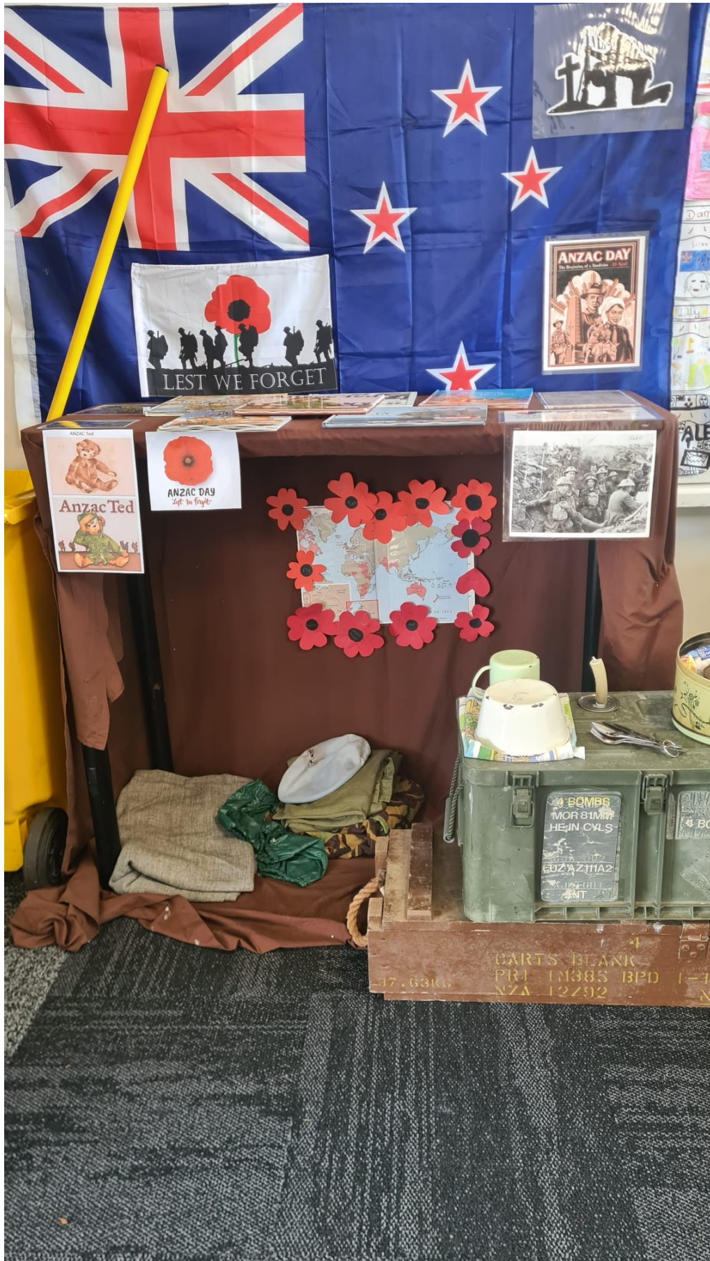
Room 5 have a soldiers WW1 trench recreated in their classroom and are doing some Inquiry learning into ANZAC Day.