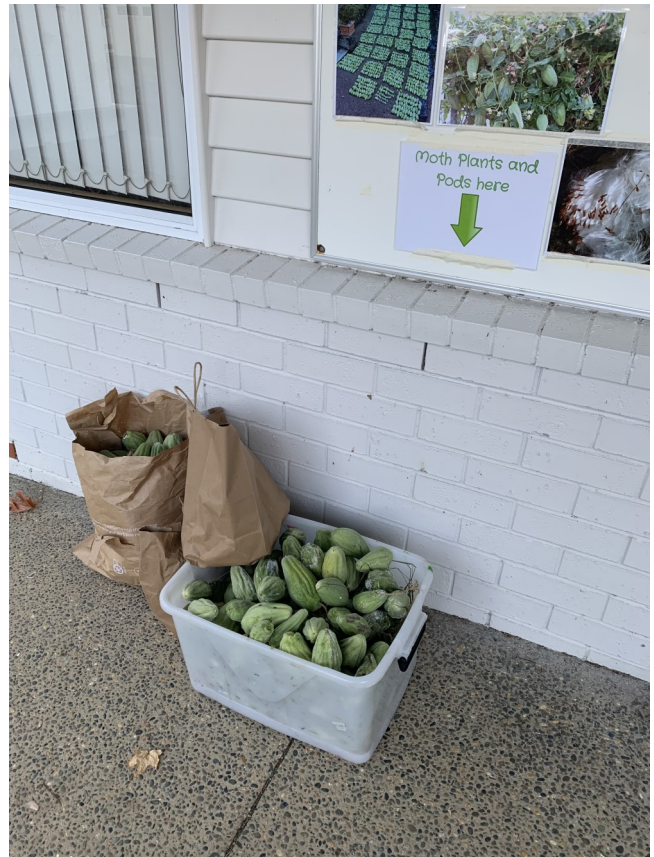
The pods keep on coming from the community