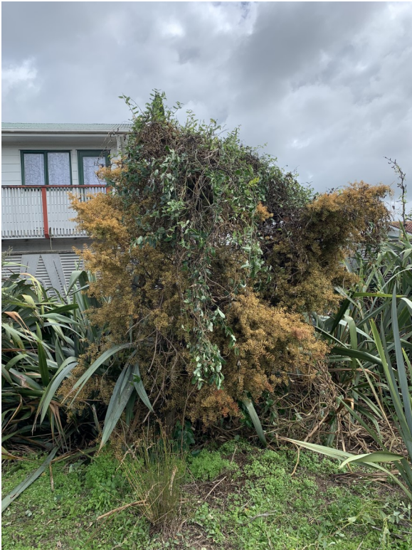
Totara dying as it is strangled by a moth plant

Don't forget to keep collecting over the school holidays. Make sure you cut the vines or pull them out at the roots. Remember our goal is to make the pods hard to find! Let's do our part to eliminate this terrible weed.