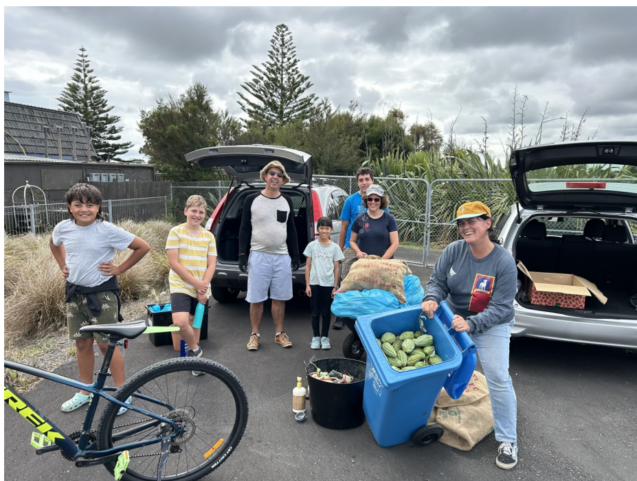
Moth Plant Busters had an awesome record collection of 1,600 pods on Saturday