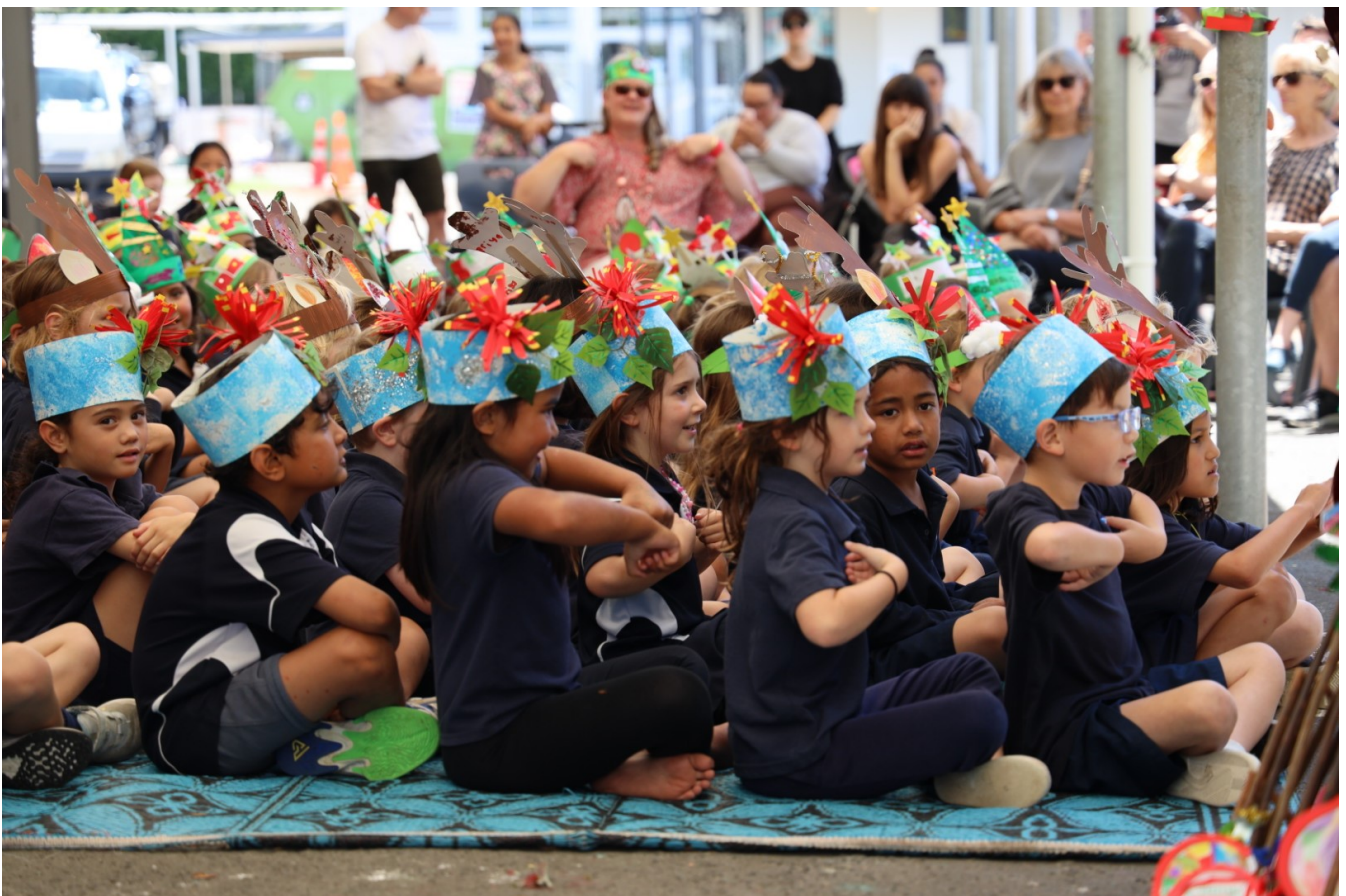
Junior School Kirihimete Concert

Just a reminder that our last day of the year is this Friday 15 December and school closes at 1pm. We open again on Thursday 1 February 2024 for our Waananga Day.