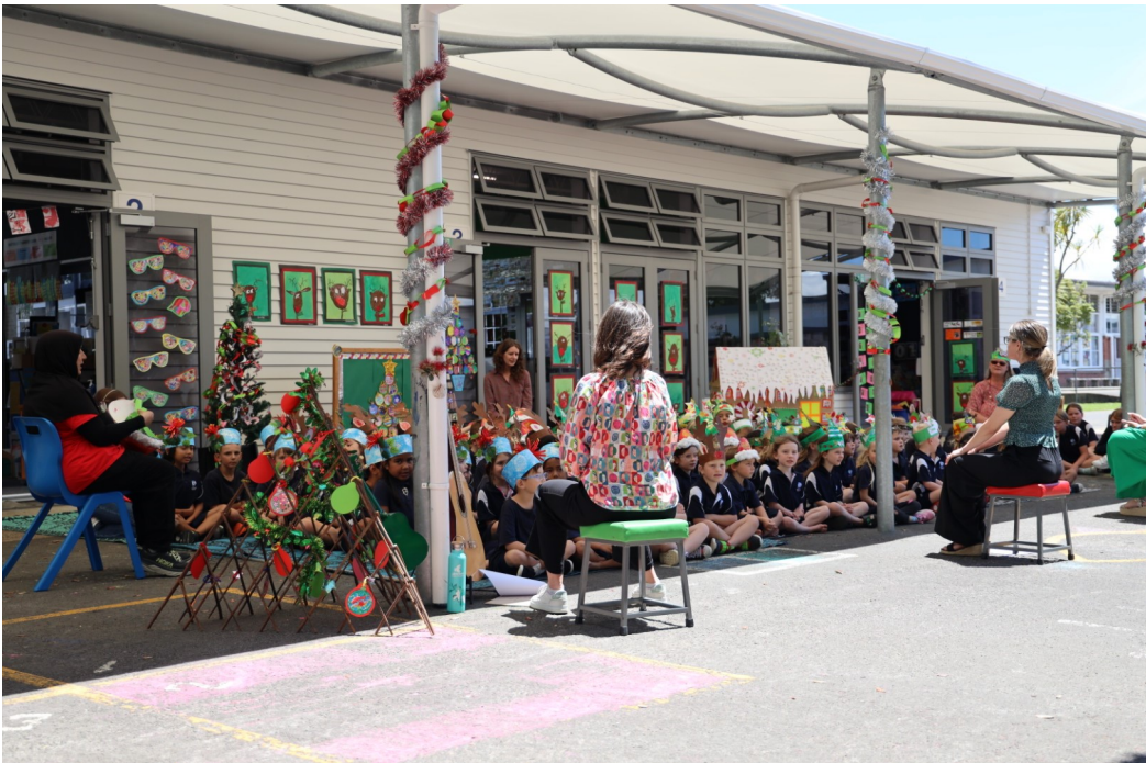
Junior School Kirihimete Concert