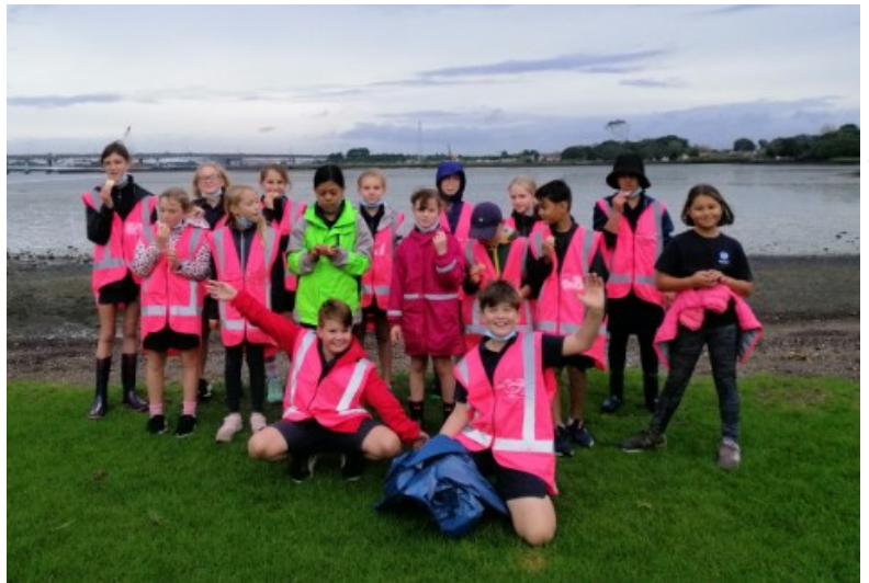
Left: The Beach Audit Team

The second Kahui Ako event was a softball tournament. This term the softball team have been practising on the turf twice a week, getting ready to take part in the Te Iti Kahurangi Zone Softball Day. Some of the children who played wrote about their experience and highlights from the day. A big thank you to all the parents and Whānau for their help on the day.