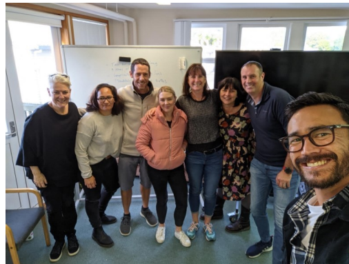
Left: The Board of Trustees in action!

need to know all about these changes. In the next few weeks we'll be asking for your feedback on changes to the Health and Physical Education Curriculum. We will do this initially through a hardcopy survey with some follow up parent workshops if there is a demand, so look out for notifications regarding this.