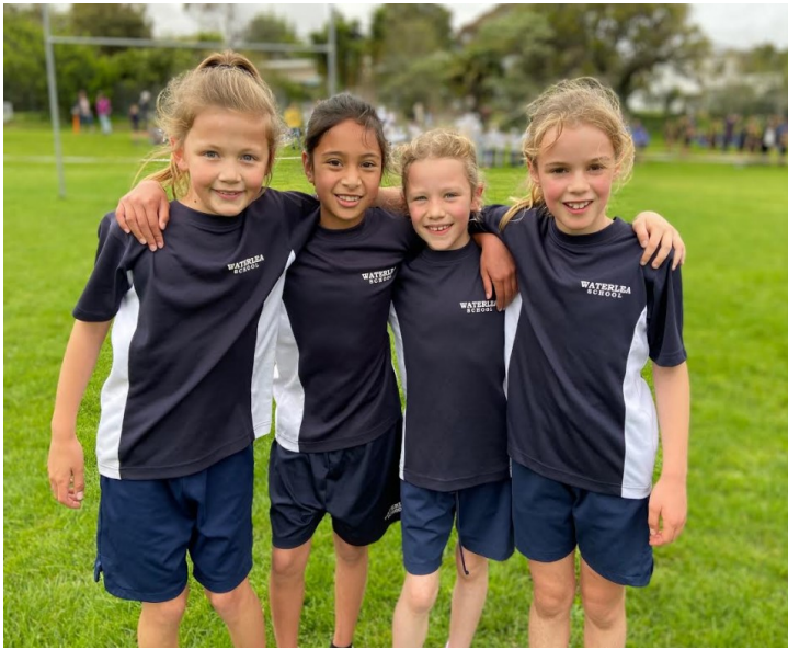
Year 4 Girls