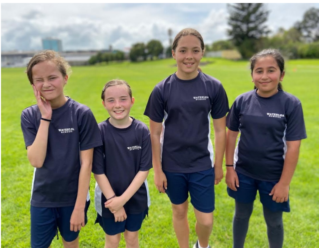
Year 6 Girls