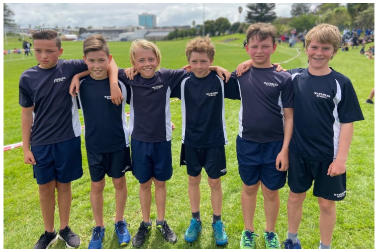
Year 6 Boys