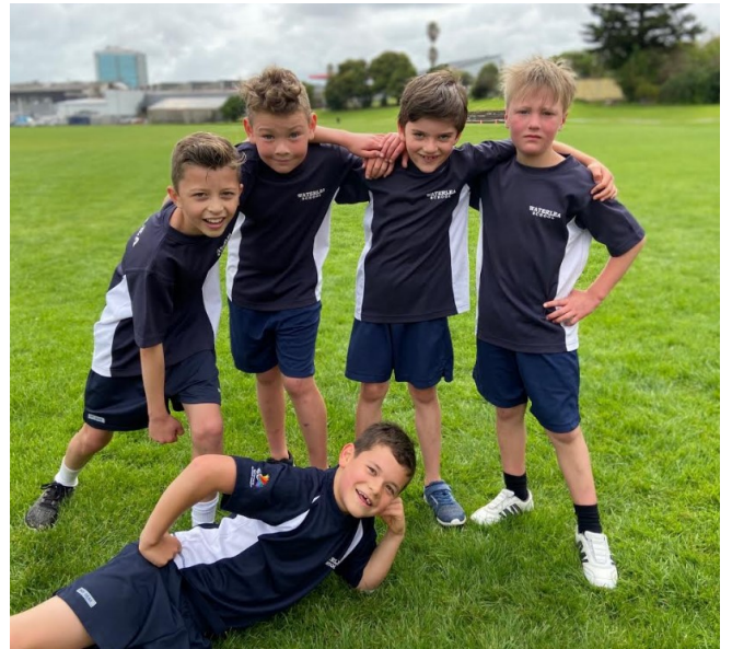
Year 4 Boys