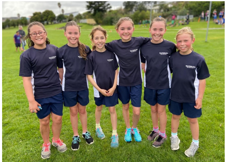
Year 5 Girls