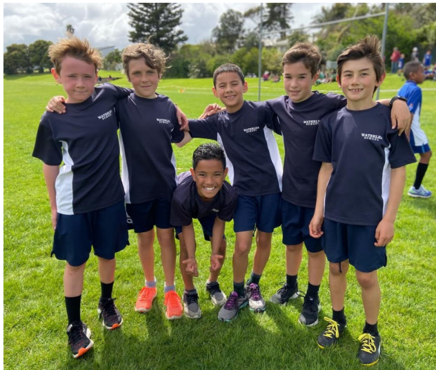
Year 5 Boys