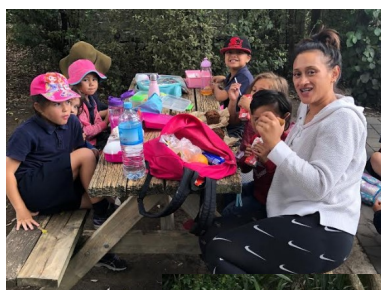
Families enjoying morning tea together at Ambury Farm

There has been a lot in the media lately about different pop ups that come up when children are online. The best way to ensure your children are safe online is to treat it in a similar way as you would the real world. Just like all other activities they are involved in, children need coaching and strategies from parents as to how to navigate tricky situations. Know what your children are doing online and discuss with them what to do if something comes on screen which makes them uncomfortable. Keeping an open line of communication is really important and also utilising mechanisms on the device to restrict access to the full functions is also a helpful way to keep our children safe while they